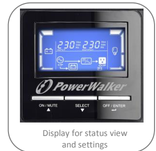
Display for status view and settings